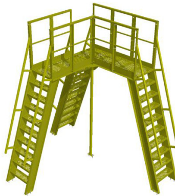
L-Shaped Custom Crossover