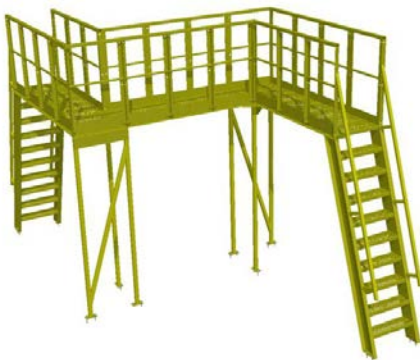
Z-Shaped Custom Crossover