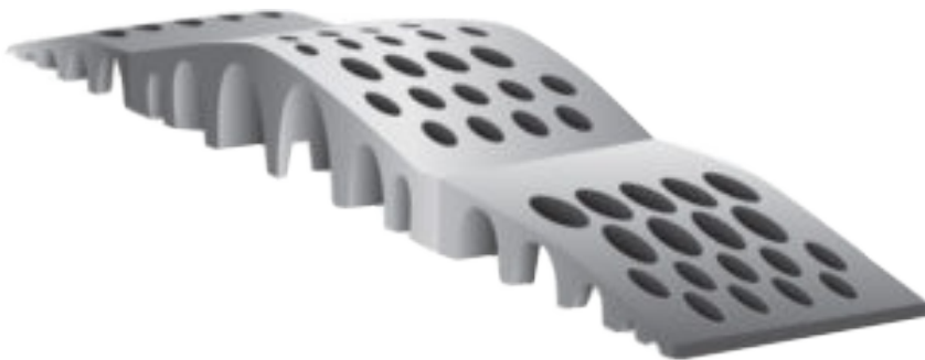
Super Hose Bridge